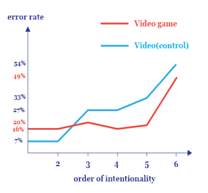
Figure 2: Error rate depending on order of intentionality