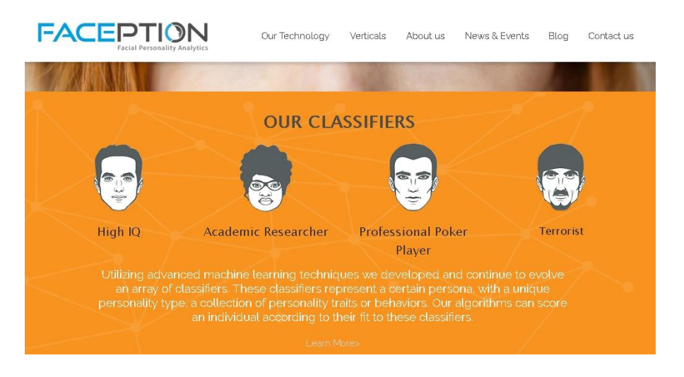
Figure 1: Image of the welcoming page from Faception.